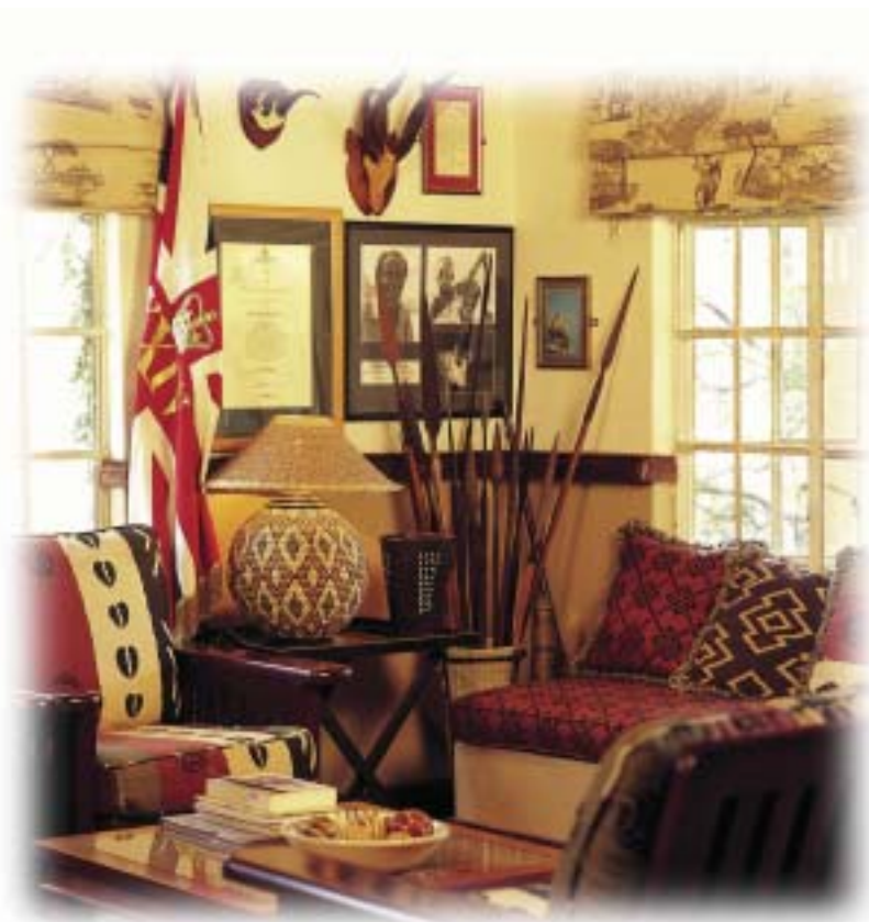
Fugitives Drift Lodge, Battlefields