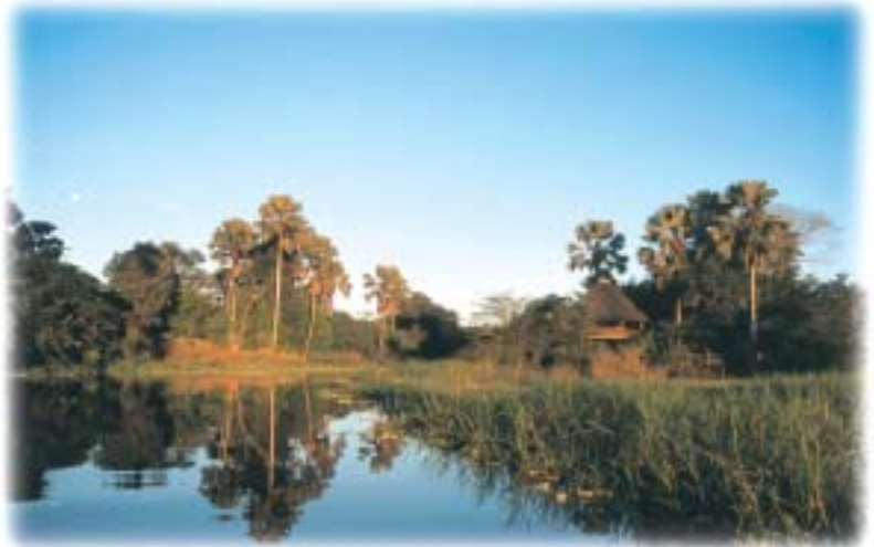
Mvuu Lodge, Malawi